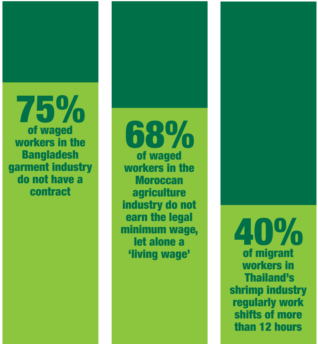
Sample size: 2442 factories

Employment becomes increasingly precarious for workers as employers shift costs and risks onto them to reduce labour costs.