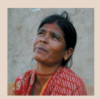
"Because we're working so much more we have to keep our children home from school"

Increasingly women are also working as labourers and porters to earn money to buy food and other essentials. This increased workload is impacting on the