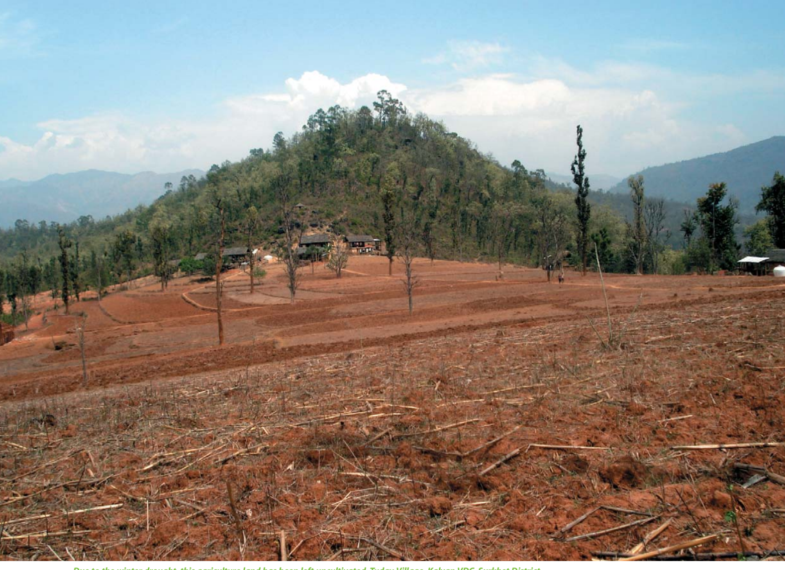
Due to the winter drought, this agriculture land has been left uncultivated, Tuday Village, Kalyan VDC, Surkhet District

considered the most food insecure. The World Food Programme currently estimates that up to 3.4 million people require food assistance in Nepal due to a combination of natural disasters (particularly winter drought) affecting agricultural production and higher food prices (that reduces the capacity to purchase food). The 2008/09 winter drought in Nepal is considered one of the worst on record in terms of rainfall but also the breadth of area impacted. In addition the 2008/09 winter was also one of the warmest with many districts particularly in the West recording record maximum temperatures<sup>32</sup>.