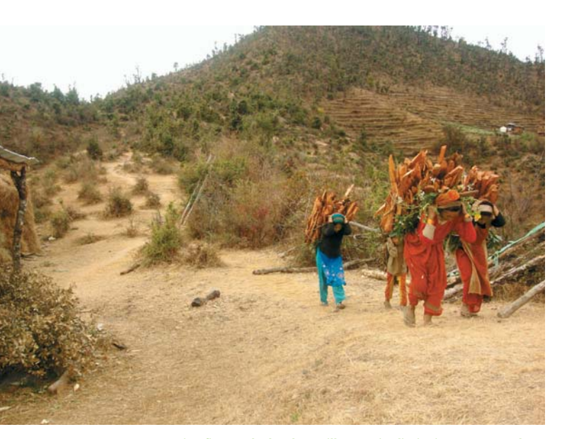
Women carrying firewood, Khordepe Village, Baitadi District. Women and girls are increasingly bearing the brunt of climate change through increased hard labour

depending on the season) and returning for festivals and the harvest (October to December). In the Terai where there is extensive agricultural land on both sides of the border, men are able to find work much closer to home, sometimes on a daily basis but in the hills with greater distances to be covered, men are absent for long periods.