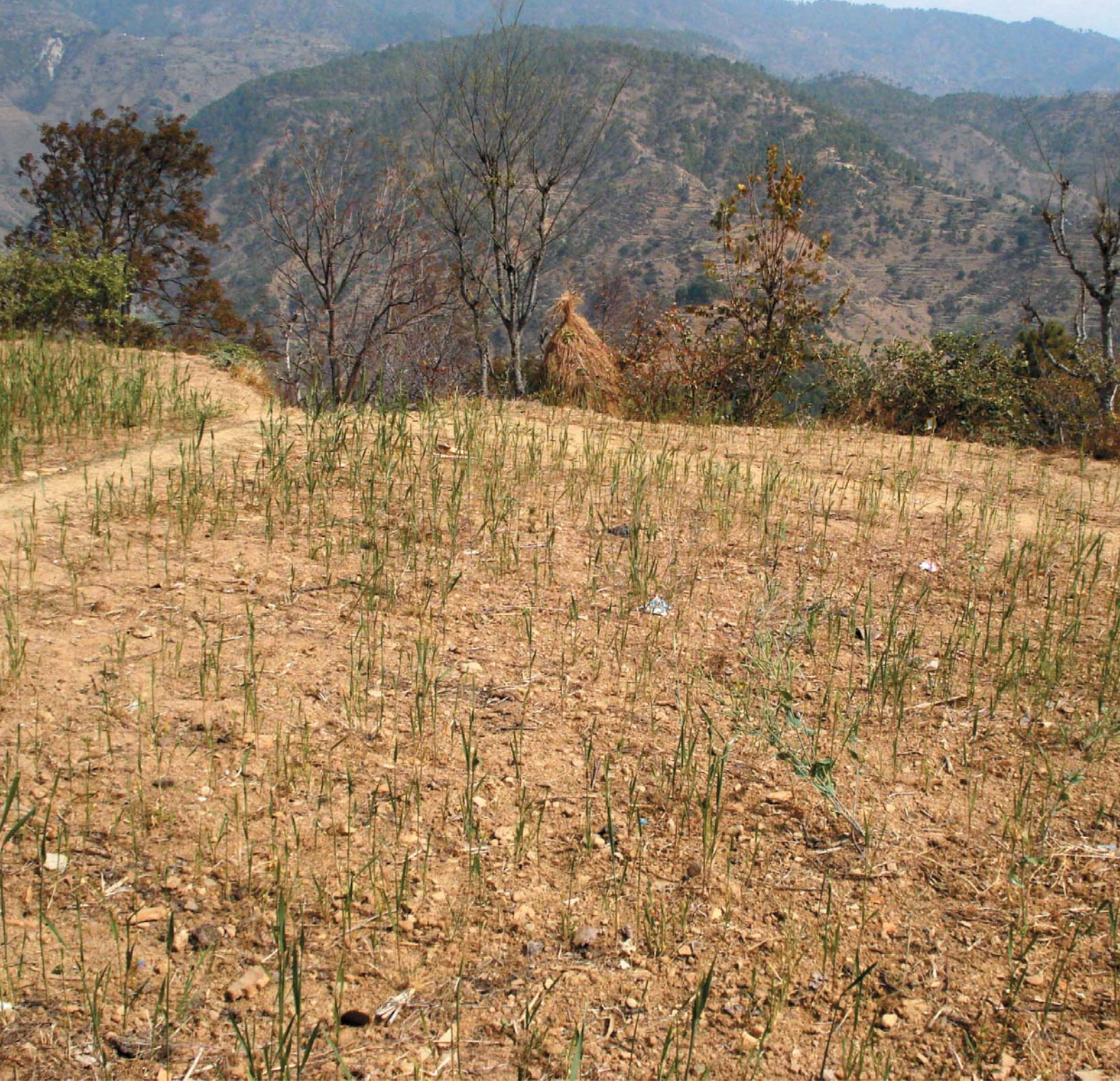
Winter drought results in a poor wheat harvest, Tatar VDC, Dadeldhura District