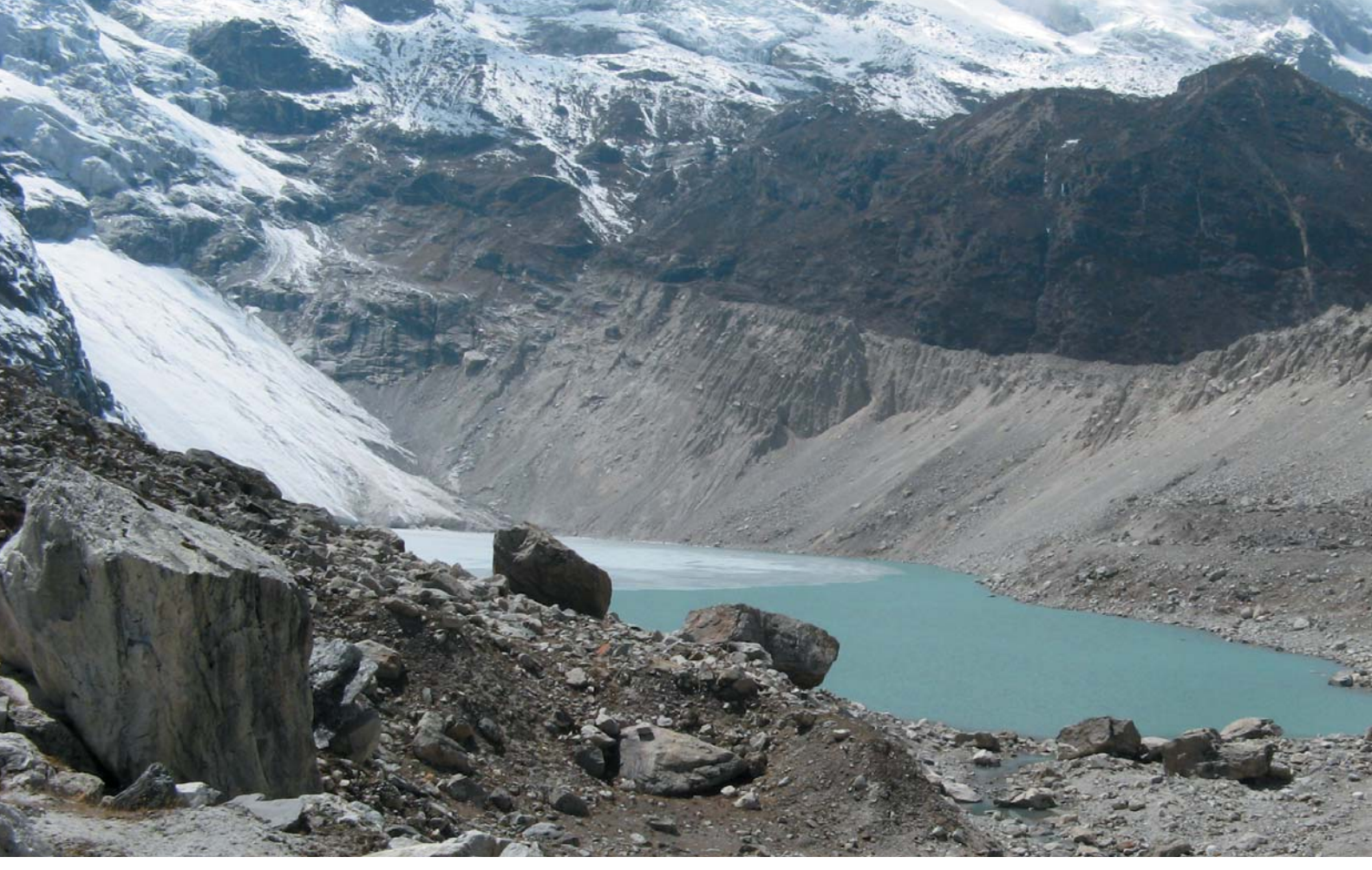
Dig Tsho Glacier Lake in Solukhumbu – Dig Tsho Glacier Lake (4,365m) burst on August 4, 1985 spilling an estimated 200 to 350 million cubic feet of icy water with a flood wave 35 to 50 feet in height. It partially destroyed a hydro-power project, 14 bridges and various trails and patches of cultivated land roughly 55 miles below and likely to burst again if climate change glacial retreat continues

debris, partially destroying the Namche Hydropower facility and washing away large areas of land, homes, livestock and inhabitants of the area. In total 20 glacial lakes are currently considered GLOF threats<sup>17</sup>.