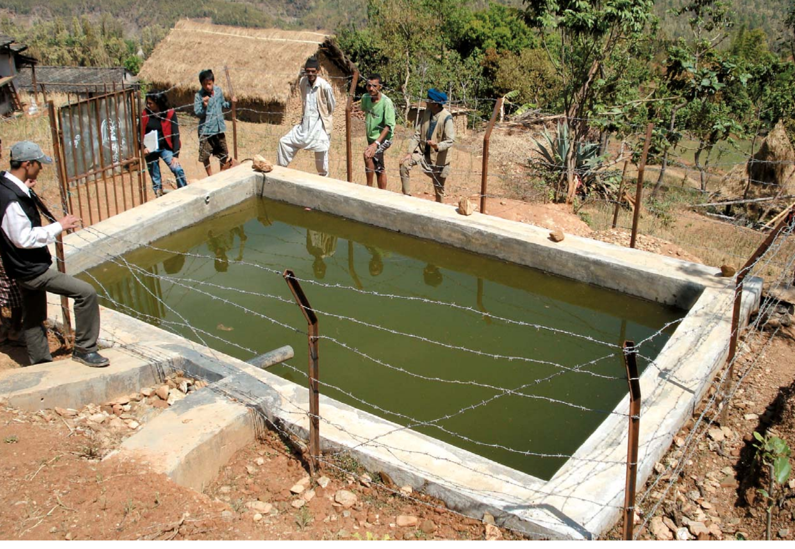
Water harvesting pond used to irrigate vegetables, Rosera VDC, Baitadi District

people feel unable to switch crops. People spoke of 'having to plant rice, even if there is no rain' and 'feeling poor if they haven't eaten rice'.