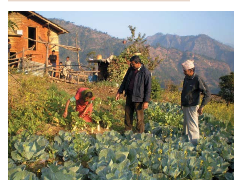
As rains are becoming more unpredictable people are switching to vegetable farming, Kaphala, Silanga VDC, Dadeldhura District

Bag Bazar Farmers' Cooperative, Dadeldhura District