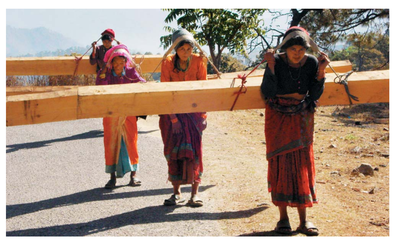
With the men of many families migrating to India for seasonal work and declining farm production, women are increasingly taking on more hard labour to generate extra money to feed their families, Gaira VDC, Doti District

Vulnerability is compounded by geographic isolation with many districts (in the Hill and Mountain regions) poorly served by roads and other infrastructure, and often isolated by landslides and floods. Access to government services and markets as well as information and technical support is limited. Furthermore, vulnerability is compounded by widespread systematic discrimination by gender, ethnicity and caste throughout Nepal. The poorest development regions also correlate with a proportionately higher population of Dalits (the so-called 'untouchable' caste) and ethnic minorities. Within these groups women are further marginalised. Women, Dalits and ethnic minorities